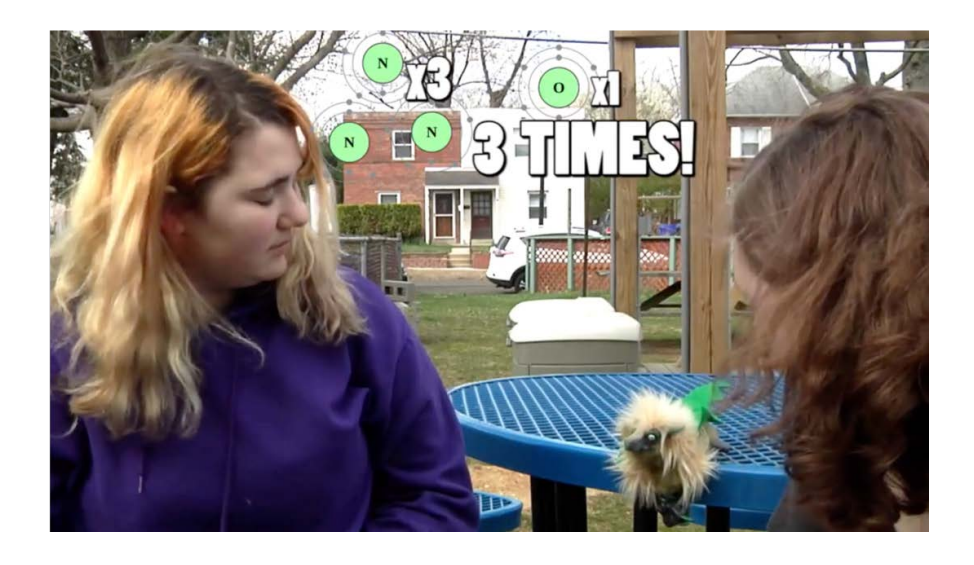
Video Link- NASA Spotlite: Composition of Earth's Atmosphere NASA eClips Website - https://nasaeclips.arc.nasa.gov/spotlite/earths-atmosphere/earths-atmosphere NASA eClips YouTube - https://youtu.be/e-wYfLpRl3U

Next, you will watch a short video about Earth's atmosphere. As you watch the video, pay close attention to any new vocabulary.