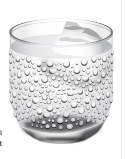
Image and Activity Source - Meteorology Activities for Grades 5-9 https://science.nasa.gov/does-air-contain-water-vapor

Have you ever observed water droplets on the outside of a glass when you were drinking a cold drink on a very warm day? Where did these droplets come from? Did the liquid seep through the glass to the outside? How do you know? Could you test a prediction about this phenomenon?